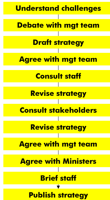
Figure 4: Steps in SBS's strategic planning process

Given that SBS's ultimate customers are small businesses, but that it delivers almost nothing directly to small businesses, much of the debate focused on what SBS needed to do to ensure that it really did understand the needs of those customers and what it needed to do to ensure that the Business Link network was effectively meeting those needs.